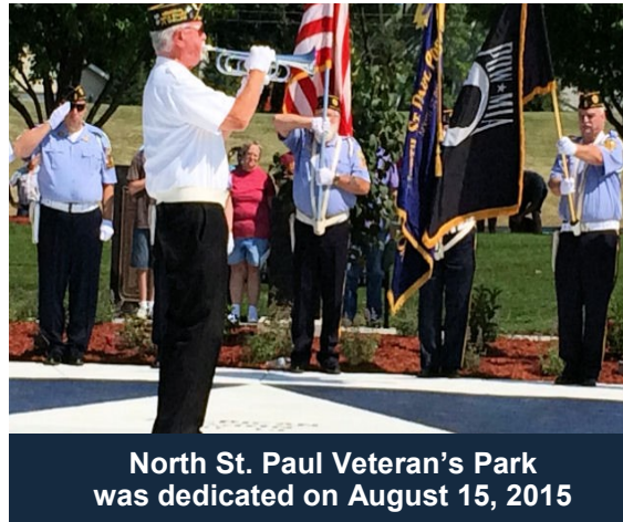
North St. Paul Veteran's Park was dedicated on August 15, 2015

Will, Trust, Bequest, Retirement Account, Life Insurance, Bank and Brokerage Accounts, or simply a memorial gift.